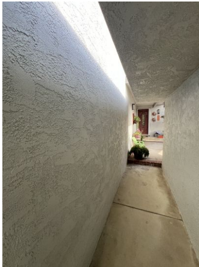
Right side (next to garage)