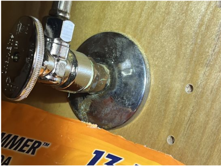
Bathroom 1 - copper