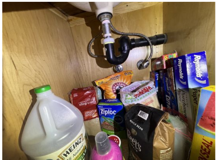
Under bathroom 1 - sink 2