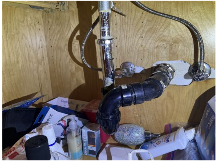
Under bathroom 2