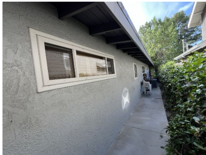
Left side (2)