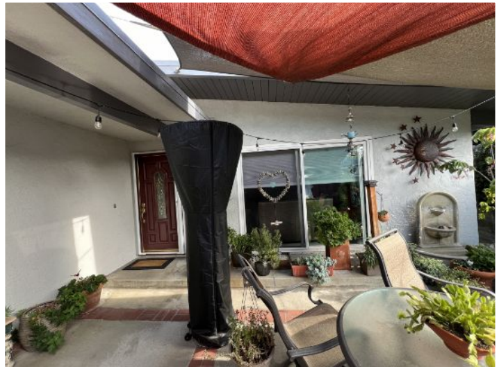
Front (behind garage)