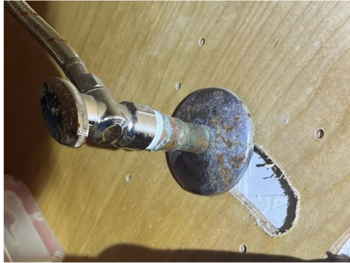
Under bathroom 2 - copper