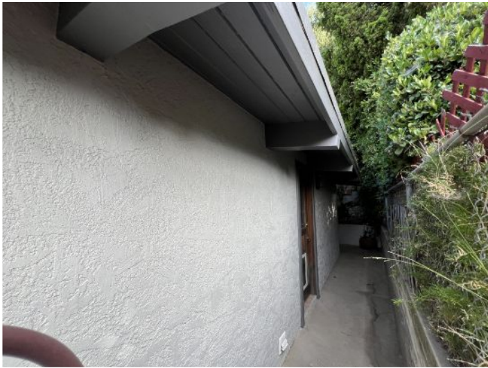
Right side (2)