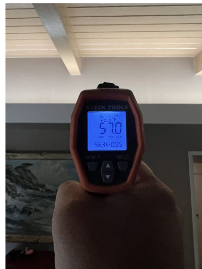
51 deg F