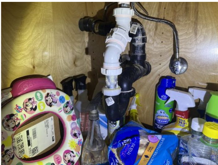
Under bathroom 1 - sink 1