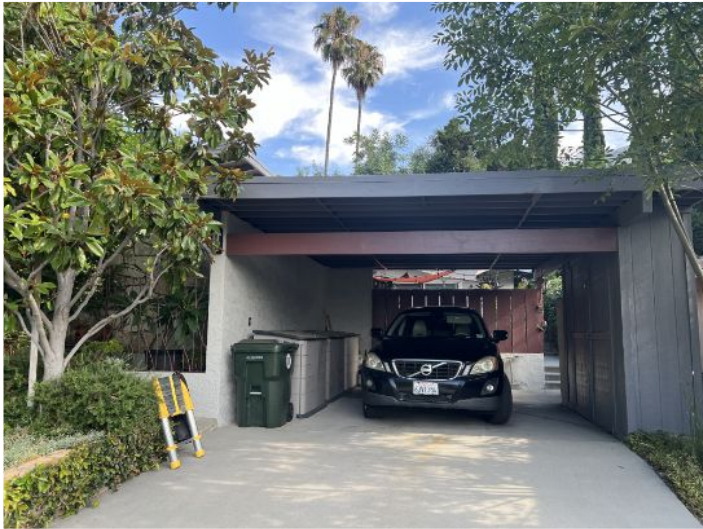
Front / Garage

A visual inspection of the exterior wall covering condition found it to be in a serviceable condition at time the of inspection.