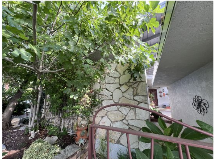
Front / Next to garage