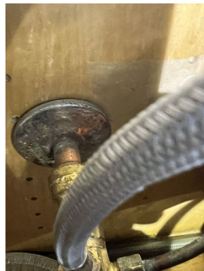
Kitchen - Copper