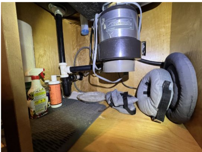
Under kitchen sink

The interior piping that supplies the water throughout the building is made of copper where visible.